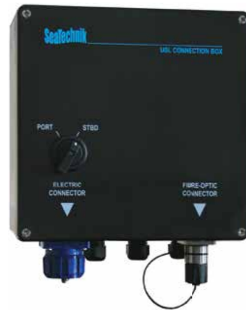
Fixed connection box