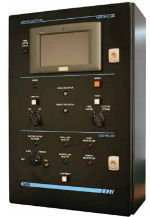
Fixed control unit