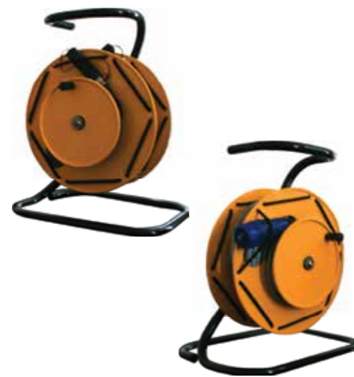
Portable fiber optic and electric umbilical cable reels